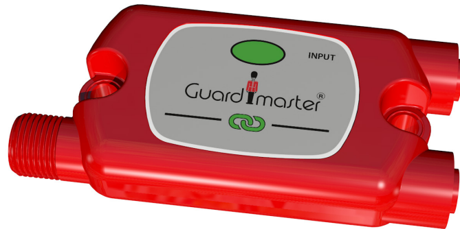
GuardLink Enabled Connection Tap

A truly connected enterprise has real-time control and information available across platforms and devices within the organization. When it comes to linking safety to The Connected Enterprise, our smart safety devices featuring GuardLink technology can deliver information, advanced functionality and flexibility, while enhancing safety and increasing efficiency machine- and plant-wide.